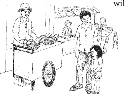
Explain the sounds and smells to your child when you go to the market.

will be easier for you and will not take extra time.